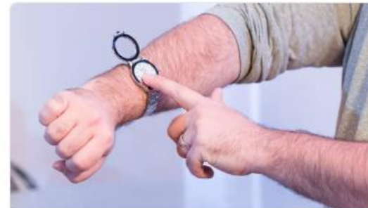
Telling the time and managing appointments