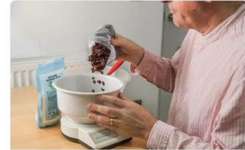
Preparing meals and snacks