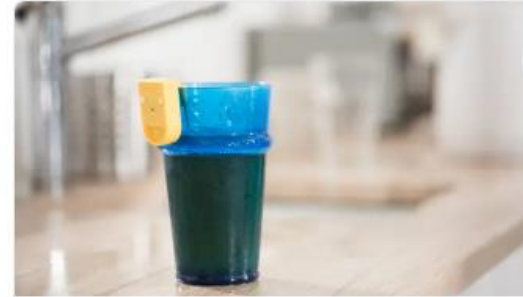
Pouring drinks safely