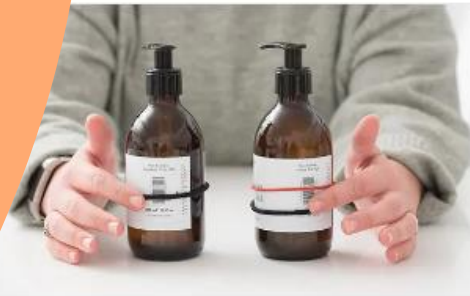
Tactile labels and markers