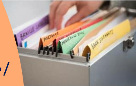
Managing your finances household work