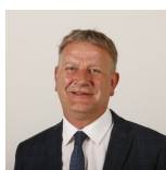
David Torrance Scottish National Party