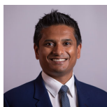
Sandesh Gulhane Scottish Conservative and Unionist Party