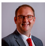
Deputy Convener Paul O'Kane Scottish Labour