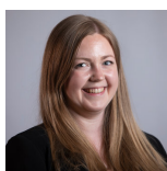
Gillian Mackay Scottish Green Party