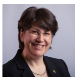
Tess White Scottish Conservative and Unionist Party