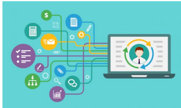
Health & Care Professionals/ Leaders