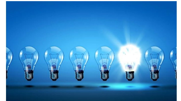
Researchers and Innovators/ Industry